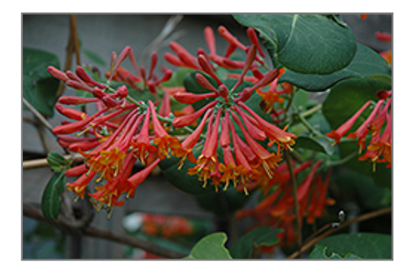
Dropmore Scarlet Trumpet Honeysuckle flowers

Dropmore Scarlet Trumpet Honeysuckle is a multi-stemmed deciduous woody vine with a twining and trailing habit of growth. Its relatively coarse texture can be used to stand it apart from other landscape plants with finer foliage.