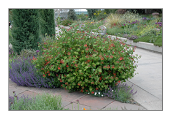
Dropmore Scarlet Trumpet Honeysuckle in bloom

This woody vine will require occasional maintenance and upkeep, and is best pruned in late winter once the threat of extreme cold has passed. It is a good choice for attracting butterflies and hummingbirds to your yard. It has no significant negative characteristics.