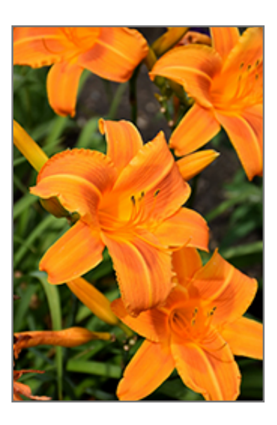
Rocket City Daylily flowers

An early-midseason bloomer, this selection features eye-catching orange flowers with copper eyezones; tall, sturdy stems rise above low growing mounds of arching green foliage; an easy to grow selection, great for perennial borders, beds and containers