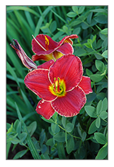
Red Razzle Dazzle Daylily flowers

Blooming from mid-late summer, this vigorous selection features large trumpeted flowers with chartreuse throats and ruffled edges that are trimmed in white; low growing mounds of arching green foliage; great for borders, beds and containers