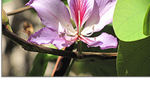
Orchid Tree flowers

A small to medium deciduous tree, producing interesting, orchid-like violet-lavender flowers in spring; foliage drops in early spring just before blooming; a colorful accent for warm, dry locations once established