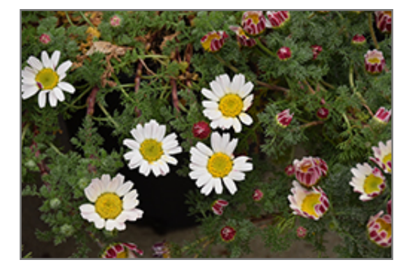
Mount Atlas Daisy flowers