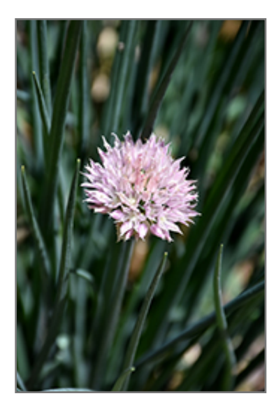
Pink Giant Chives flowers

Pink Giant Chives is recommended for the following landscape applications;