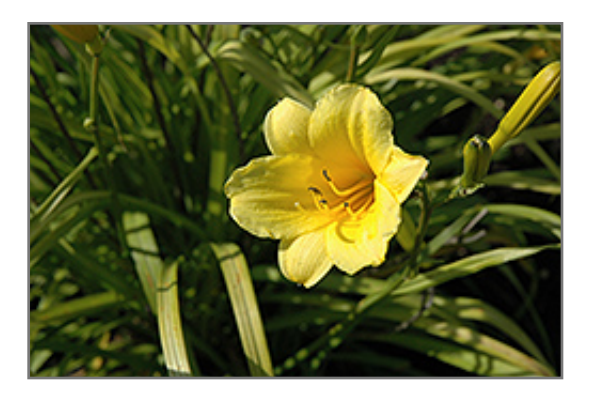
Pennysworth Daylily flowers