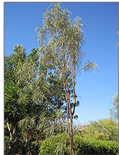
Shoestring Acacia