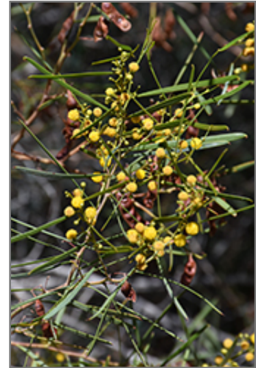
Shoestring Acacia flowers

Shoestring Acacia is recommended for the following landscape applications;