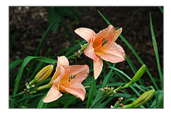
Orchard Sprite Daylily flowers