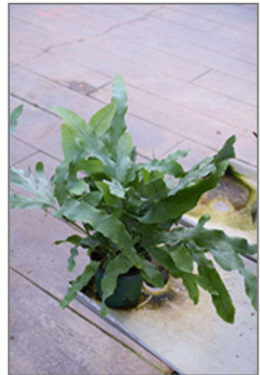
Blue Star Fern in full