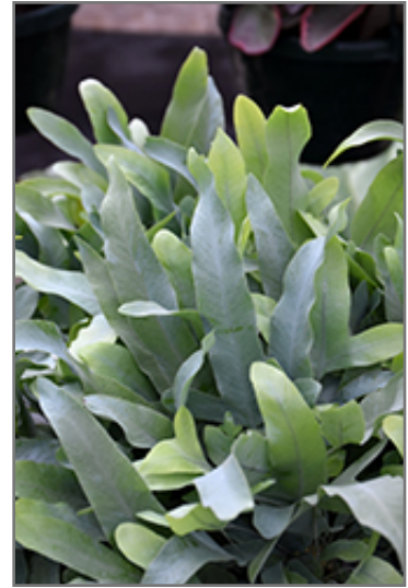
Blue Star Fern foliage

This is a dense herbaceous evergreen houseplant with a shapely form and gracefully arching foliage. Its relatively fine texture sets it apart from other indoor plants with less refined foliage. This plant should not require much pruning, except when necessary to keep it looking its best.