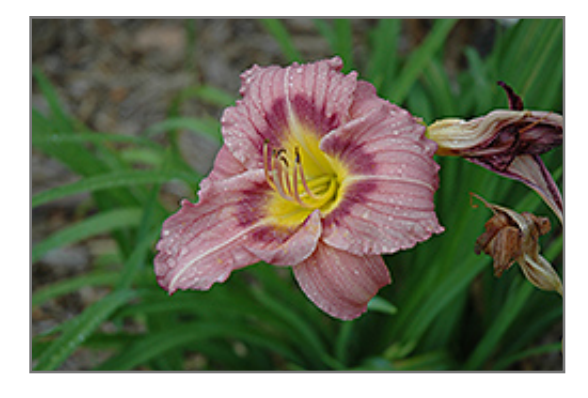
Numinous Moments Daylily flowers