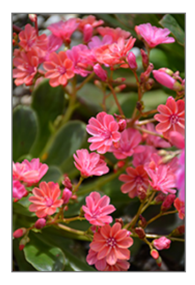
Jewels Coral Bitteroot flowers