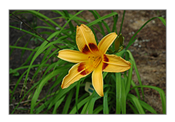
Mikado Daylily flowers