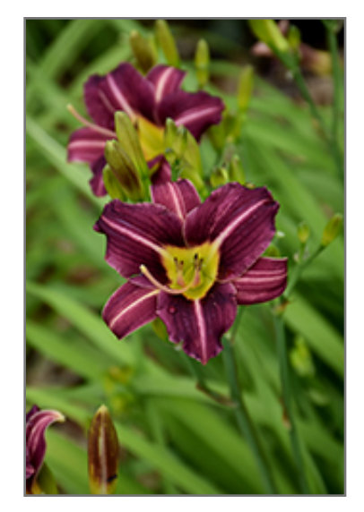
Mary Reed Daylily flowers

A long blooming selection that features purple trumpets with white midribs and yellow throats; green arching foliage adds a lovely texture to borders, beds and containers; a lovely addition to fresh cut flower arrangements