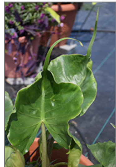
Stingray Elephant's Ear foliage