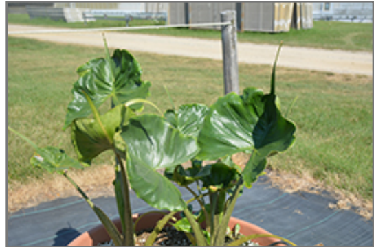
Stingray Elephant's Ear

This is an open herbaceous evergreen houseplant with an upright spreading habit of growth. This plant usually looks its best without pruning, although it will tolerate pruning.