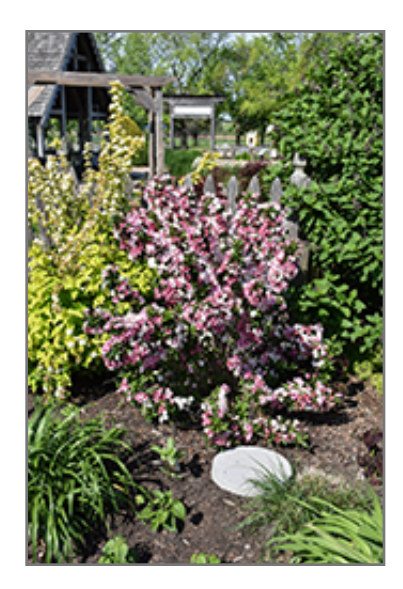
Czechmark Trilogy Weigela in bloom