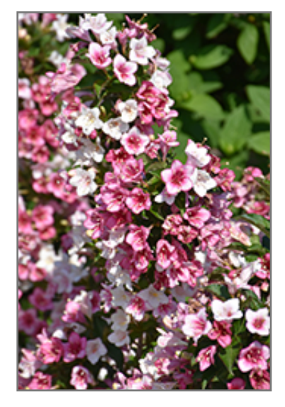
Czechmark Trilogy Weigela flowers

Czechmark Trilogy Weigela is recommended for the following landscape applications;