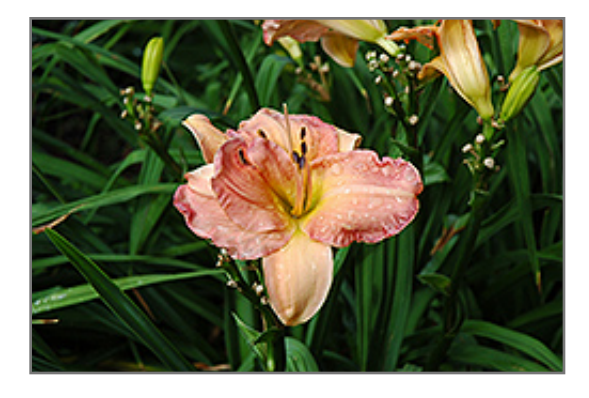
Making Friends Daylily flowers