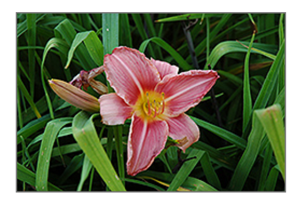
Mabel Fuller Daylily flowers