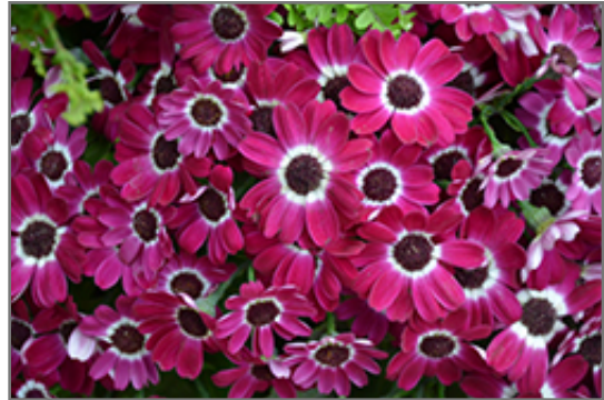
Senetti Baby Magenta Bicolor Pericallis flowers