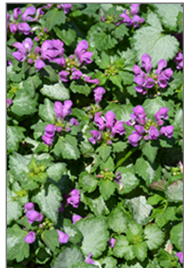
Purple Chablis Spotted Dead Nettle flowers