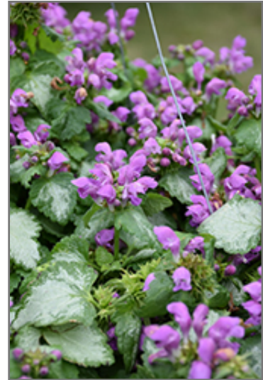
Purple Chablis Spotted Dead Nettle flowers

Purple Chablis Spotted Dead Nettle is recommended for the following landscape applications;