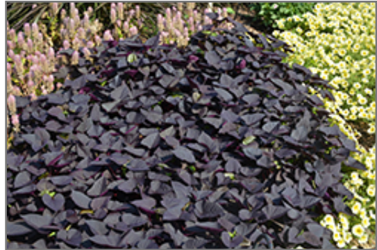
Sweet Caroline Sweetheart Jet Black Sweet Potato Vine

This is a relatively low maintenance plant. The flowers of this plant may actually detract from its ornamental features, so they can be removed as they appear. It has no significant negative characteristics.