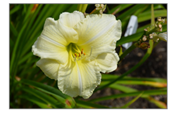
Joan Senior Daylily flowers