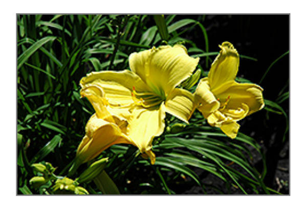
Java Sea Daylily flowers