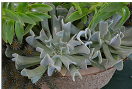
Topsy Turvy Echeveria

This is a dense herbaceous evergreen houseplant with tall flower stalks held atop a low mound of foliage. Its relatively fine texture sets it apart from other indoor plants with less refined foliage. This plant should not require much pruning, except when necessary to keep it looking its best.