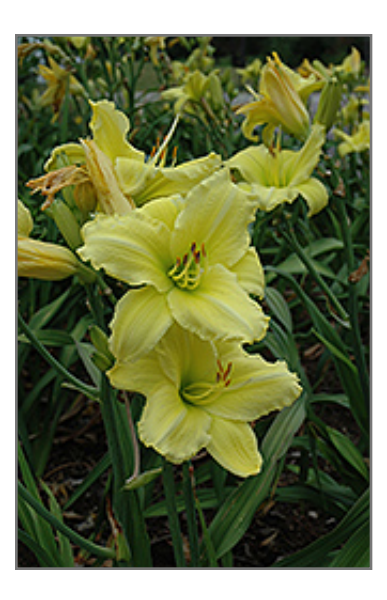
Imperial Lemon Daylily flowers

Large, heavily ruffled lemon yellow flowers with chartreuse throats; strong, sturdy stems rise above mounds of arching green foliage; early-midseason selection with good rebloom; easy to grow variety, great in borders, containers or grown en masse