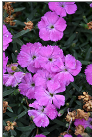
Paint The Town Fuchsia Pinks flowers

Paint The Town Fuchsia Pinks is an herbaceous evergreen perennial with a mounded form. It brings an extremely fine and delicate texture to the garden composition and should be used to full effect.