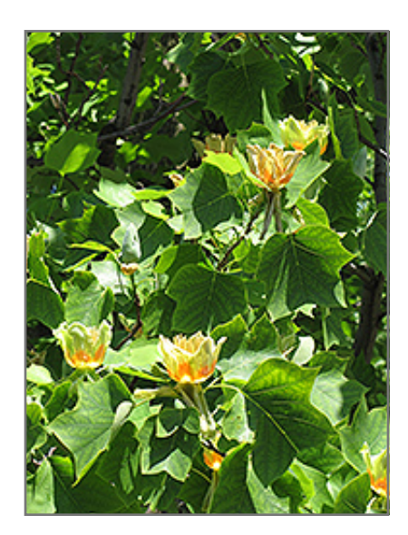
Tuliptree flowers