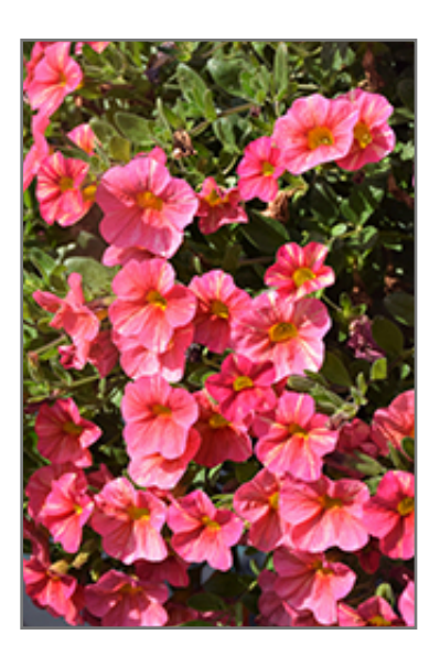
Superbells Tropical Sunrise Calibrachoa flowers