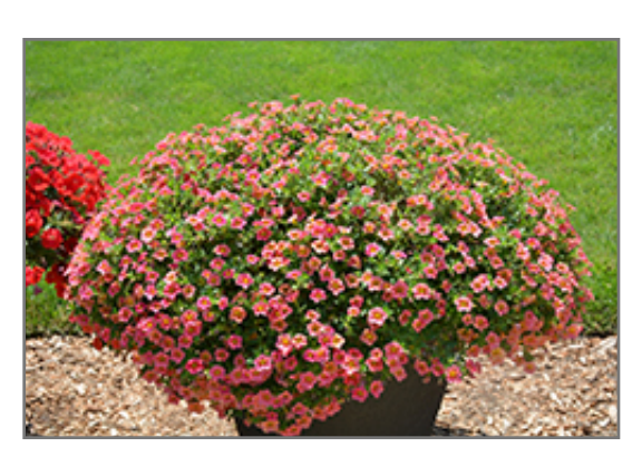
Superbells Tropical Sunrise Calibrachoa in bloom