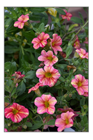
Superbells Tropical Sunrise Calibrachoa flowers

Superbells Tropical Sunrise Calibrachoa is a dense herbaceous annual with a trailing habit of growth, eventually spilling over the edges of hanging baskets and containers. Its medium texture blends into the garden, but can always be balanced by a couple of finer or coarser plants for an effective composition.