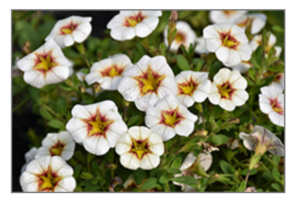
Superbells Frostfire Calibrachoa flowers

Superbells Frostfire Calibrachoa is blanketed in stunning creamy white trumpet-shaped flowers with yellow throats and dark red veins at the ends of the stems from late spring to early fall. Its small pointy leaves remain green in colour throughout the season.