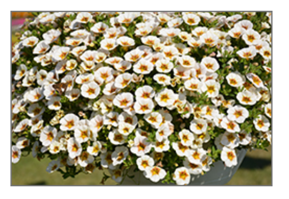
Superbells Frostfire Calibrachoa flowers