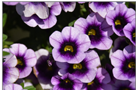
Superbells Blue Moon Punch Calibrachoa flowers