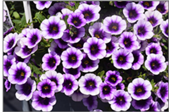
Superbells Blue Moon Punch Calibrachoa flowers

Superbells Blue Moon Punch Calibrachoa is a dense herbaceous annual with a trailing habit of growth, eventually spilling over the edges of hanging baskets and containers. Its medium texture blends into the garden, but can always be balanced by a couple of finer or coarser plants for an effective composition.