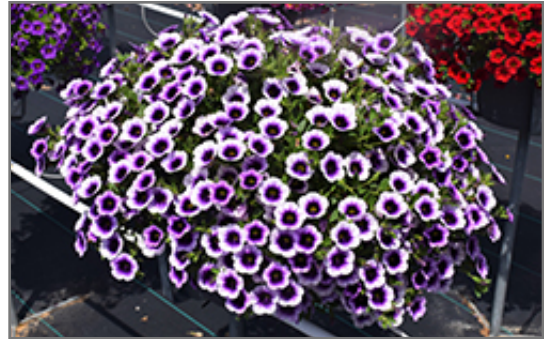
Superbells Blue Moon Punch Calibrachoa in bloom