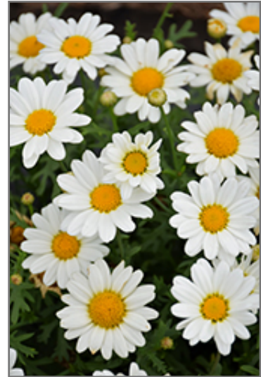
Pure White Butterfly Marguerite Daisy flowers

Pure White Butterfly Marguerite Daisy is recommended for the following landscape applications;