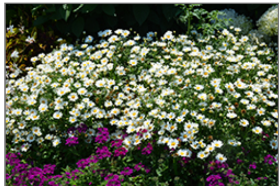
Pure White Butterfly Marguerite Daisy in bloom