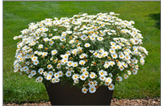
Pure White Butterfly Marguerite Daisy in bloom

Pure White Butterfly Marguerite Daisy is a fine choice for the garden, but it is also a good selection for planting in outdoor pots and containers. It is often used as a 'filler' in the 'spiller-thriller-filler' container combination, providing a mass of flowers against which the larger thriller plants stand out. Note that when growing plants in outdoor containers and baskets, they may require more frequent waterings than they would in the yard or garden.