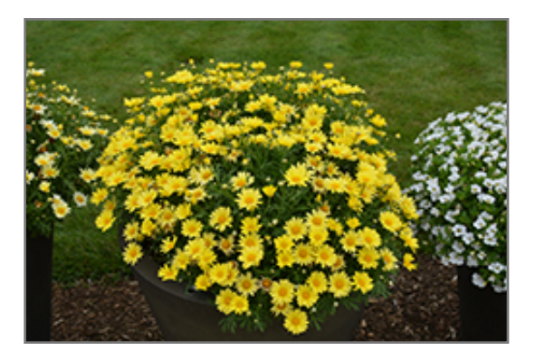
Golden Butterfly Marguerite Daisy in bloom

This plant will require occasional maintenance and upkeep, and should not require much pruning, except when necessary, such as to remove dieback. It is a good choice for attracting butterflies to your yard. It has no significant negative characteristics.