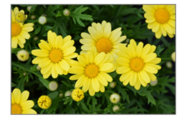
Golden Butterfly Marguerite Daisy flowers

Golden Butterfly Marguerite Daisy is an herbaceous annual with an upright spreading habit of growth. Its relatively fine texture sets it apart from other garden plants with less refined foliage.