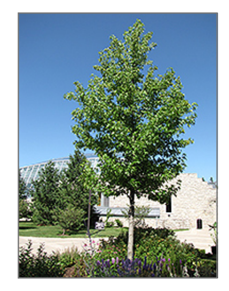
Sweet Gum

This tree should only be grown in full sunlight. It prefers to grow in average to moist conditions, and shouldn't be allowed to dry out. It is very fussy about its soil conditions and must have rich, acidic soils to ensure success, and is subject to chlorosis (yellowing) of the foliage in alkaline soils. It is somewhat tolerant of urban pollution. This species is native to parts of North America.