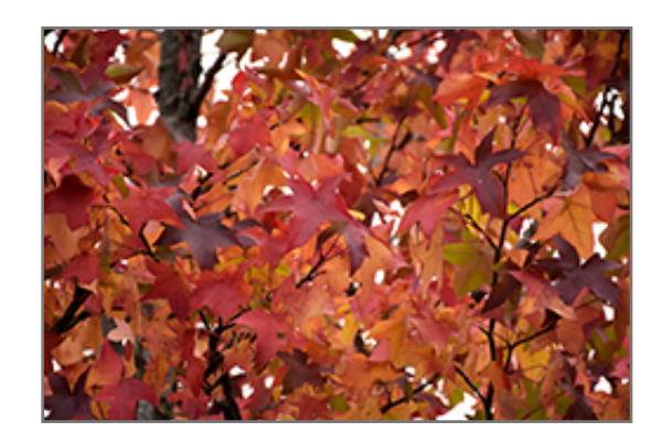
Sweet Gum in fall