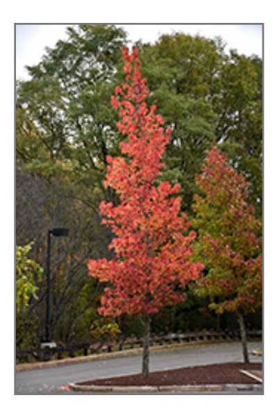
Sweet Gum in fall

This is a high maintenance tree that will require regular care and upkeep, and is best pruned in late winter once the threat of extreme cold has passed. Deer don't particularly care for this plant and will usually leave it alone in favor of tastier treats. Gardeners should be aware of the following characteristic(s) that may warrant special consideration;