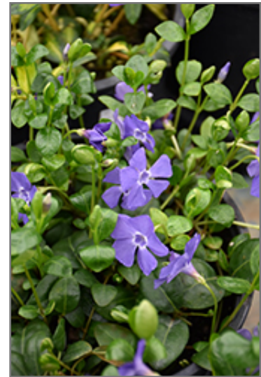
Bowles Cunningham Periwinkle flowers

This is a high maintenance plant that will require regular care and upkeep, and should not require much pruning, except when necessary, such as to remove dieback. Deer don't particularly care for this plant and will usually leave it alone in favor of tastier treats. Gardeners should be aware of the following characteristic(s) that may warrant special consideration;