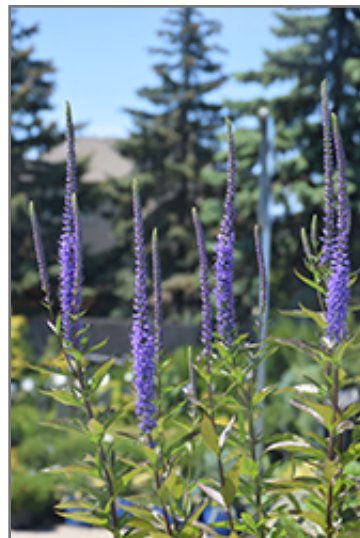
Blue Skywalker Speedwell flowers

This is a relatively low maintenance plant, and should only be pruned after flowering to avoid removing any of the current season's flowers. It is a good choice for attracting butterflies to your yard, but is not particularly attractive to deer who tend to leave it alone in favor of tastier treats. It has no significant negative characteristics.