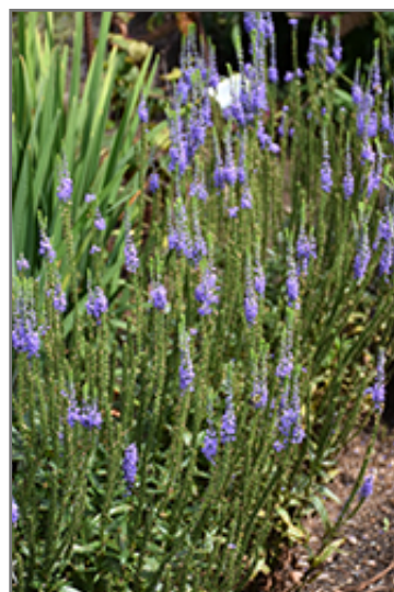
Blue Skywalker Speedwell flowers