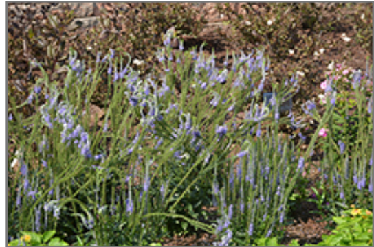
Blue Skywalker Speedwell in bloom

Blue Skywalker Speedwell will grow to be about 24 inches tall at maturity, with a spread of 18 inches. When grown in masses or used as a bedding plant, individual plants should be spaced approximately 16 inches apart. Its foliage tends to remain dense right to the ground, not requiring facer plants in front. It grows at a medium rate, and under ideal conditions can be expected to live for approximately 8 years. As an herbaceous perennial, this plant will usually die back to the crown each winter, and will regrow from the base each spring. Be careful not to disturb the crown in late winter when it may not be readily seen!