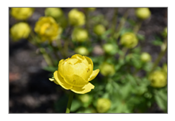
Lemon Supreme Globeflower flowers