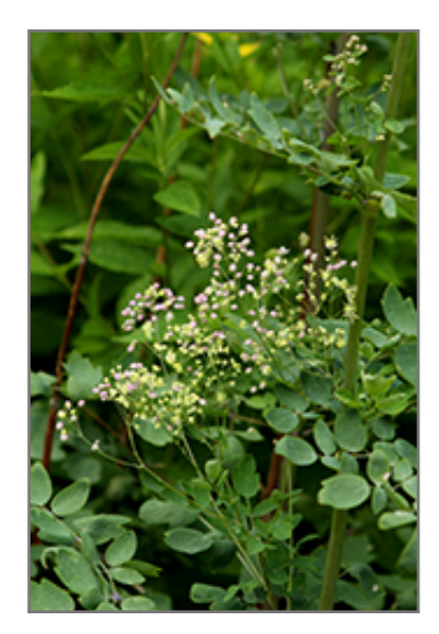
Elin Meadow Rue flowers