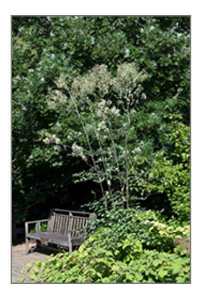
Elin Meadow Rue in bloom

Elin Meadow Rue is recommended for the following landscape applications;