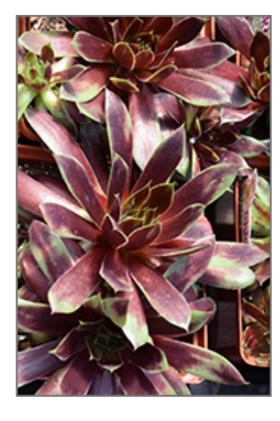
Chick Charms Cranberry Cocktail Hens And Chicks

This plant will require occasional maintenance and upkeep, and should not require much pruning, except when necessary, such as to remove dieback. Deer don't particularly care for this plant and will usually leave it alone in favor of tastier treats. Gardeners should be aware of the following characteristic(s) that may warrant special consideration;