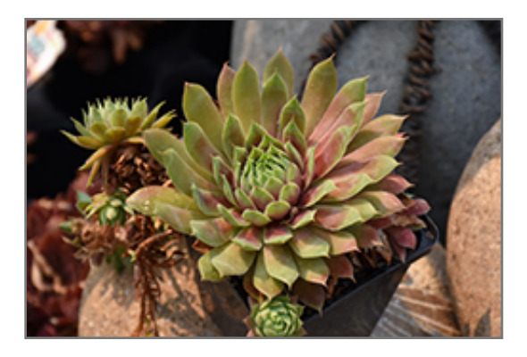
Chick Charms Cranberry Cocktail Hens And Chicks