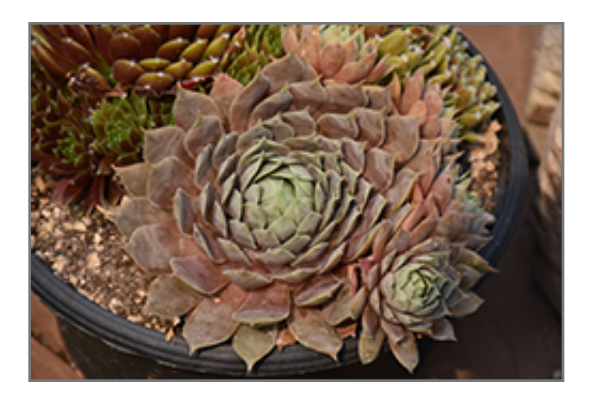
Chick Charms Berry Blues Hens And Chicks

Chick Charms Berry Blues Hens And Chicks is primarily valued in the garden for its distinctive form, with the flower stalks towering over the foliage. It attractive succulent pointy leaves emerge light green in spring, turning powder blue in colour with hints of pink. As an added bonus, the foliage turns a gorgeous burgundy in the fall. The brick red stems can be quite attractive.