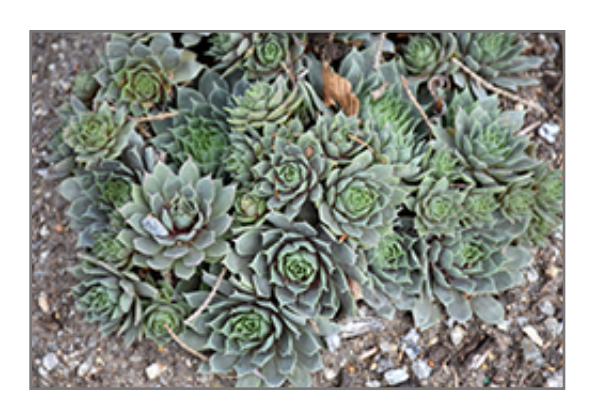
Chick Charms Berry Blues Hens And Chicks