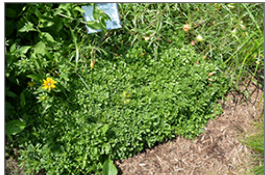
Czar's Gold Stonecrop