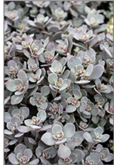
SunSparkler Blue Elf Sedoro foliage

SunSparkler Blue Elf Sedoro is a fine choice for the garden, but it is also a good selection for planting in outdoor pots and containers. Because of its spreading habit of growth, it is ideally suited for use as a 'spiller' in the 'spiller-thriller-filler' container combination; plant it near the edges where it can spill gracefully over the pot. Note that when growing plants in outdoor containers and baskets, they may require more frequent waterings than they would in the yard or garden. Be aware that in our climate, most plants cannot be expected to survive the winter if left in containers outdoors, and this plant is no exception. Contact our experts for more information on how to protect it over the winter months.