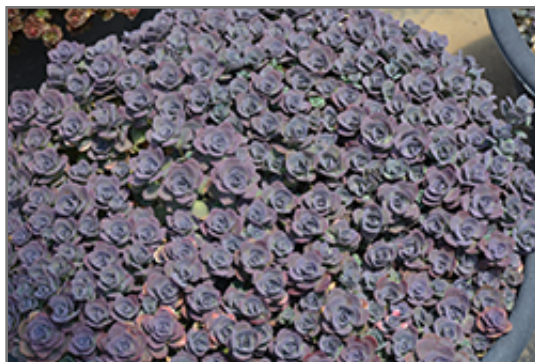
SunSparkler Blue Elf Sedoro