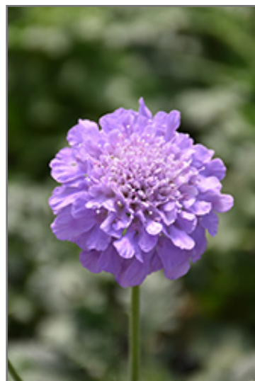
Flutter Deep Blue Pincushion Flower flowers