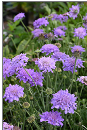
Flutter Deep Blue Pincushion Flower flowers

Flutter Deep Blue Pincushion Flower is recommended for the following landscape applications;