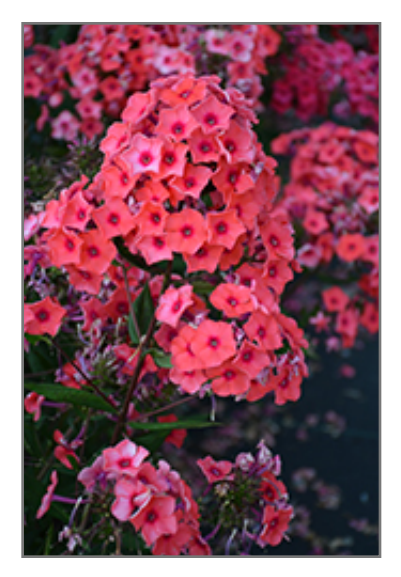
Tequila Sunrise Garden Phlox flowers

Amazing summer blooms of luminous salmon-red flowers with dark red centers, on compact plants suitable for containers or small perennial borders; good mildew resistance