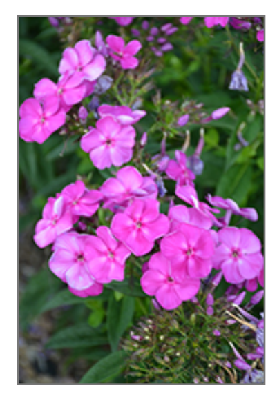
Purple Kiss Garden Phlox flowers