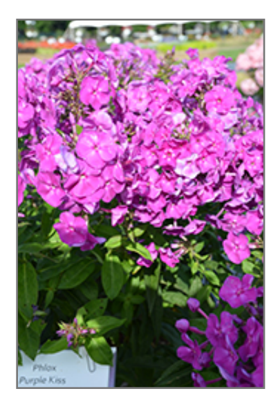
Purple Kiss Garden Phlox flowers

Purple Kiss Garden Phlox is recommended for the following landscape applications;