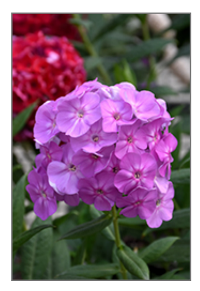
Goliath Garden Phlox flowers

An impressive variety producing huge, pyramidal flower heads of long blooming violet-lavender florets with white eyes; blooms from mid to late summer on upright bushy plants; deadhead to promote re-blooming; a stunning addition to borders