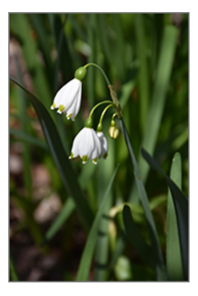
Summer Snowflake flowers

Dainty nodding white bell flowers with chartreuse petal tips over the strap shaped, glossy dark green leaves; excellent for borders, rock gardens, pond margins, or containers