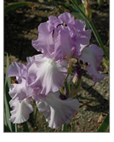
Mary Frances Iris flowers

This beautiful tall iris produces lavender blooms with white falls that are edged in lavender; a stunning addition to the perennial border; also excellent massed in groupings in the garden; will quickly form dense colonies