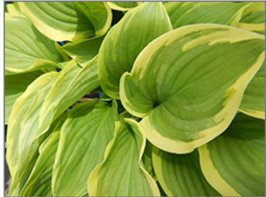
Fragrant Dream Hosta foliage