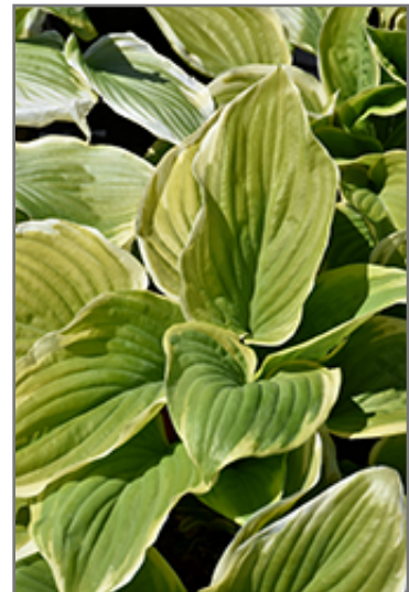
Fragrant Dream Hosta foliage