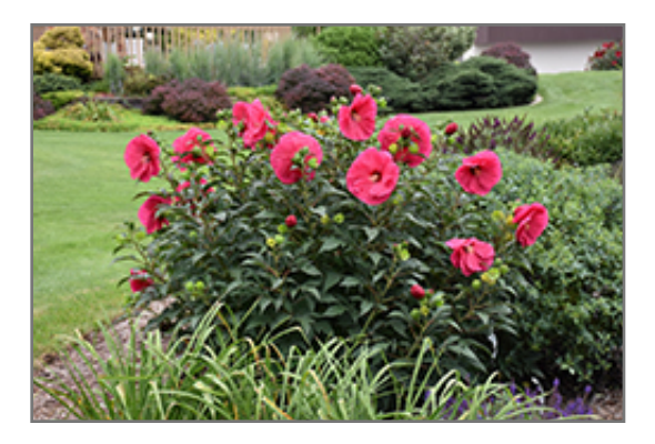
Summer In Paradise Hibiscus in bloom