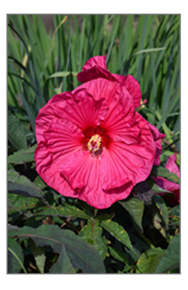
Summer In Paradise Hibiscus flowers