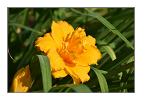
Chesapeake Crablegs Daylily flowers

Bright orange blooms with long, graceful recurved petals and gold to olive throats; great grassy texture and form; diploid; a visually interesting addition to the garden or border that is easy to care for